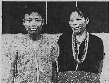
Traditional costumes of the Thais.

Pornsak and I hope that you will visit Thailand. In Thailand, there are many places that you can visit and many beautiful sights. Every Wednesday, students of our school will put on their traditional costumes. There are 11 types of minority groups in our school. It will be wonderful to see all of them put on their costumes.